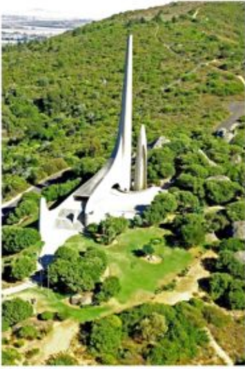
Figure 14.1 Afrikaans Language Monument near Paarl