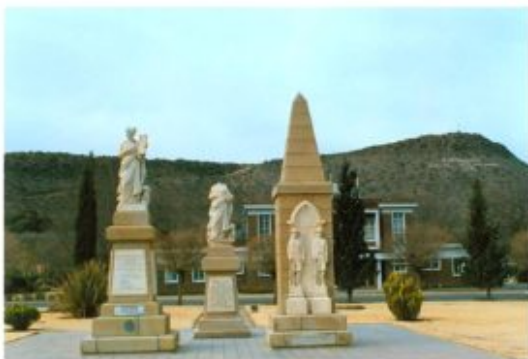
Figure 14.2 Dutch Language Monument in Burgersdorp. Left: copy of the original statue from 1908; middle: original statue from 1893, which was destroyed by British soldiers in 1900; right: a monument which commemorates the Anglo-Boer War.

However, after singing the nationalist Afrikanerbond song, the proceedings were closed with the singing of 'God save the King'. Die Patriot and De Zuid-Afrikaan, Cape newspapers that supported Afrikaner nationalism, cried shame on it. [v]